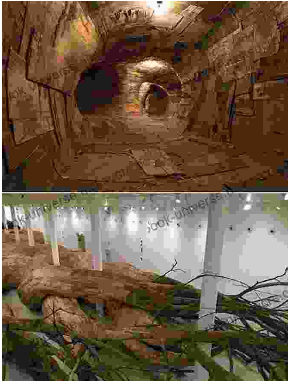
Isabelle Silbery's 'The Light Within' installation

In her installation "The Light Within," Silbery uses recycled materials to create a labyrinthine tunnel filled with glowing lanterns. As viewers navigate through the tunnel, they are enveloped in an ethereal atmosphere that evokes a sense of wonder and contemplation.