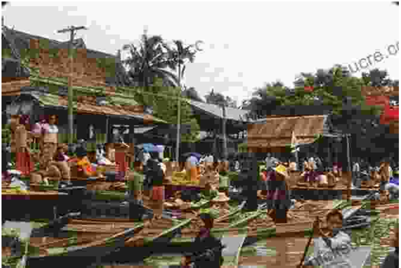
Bangkok in the 1960s