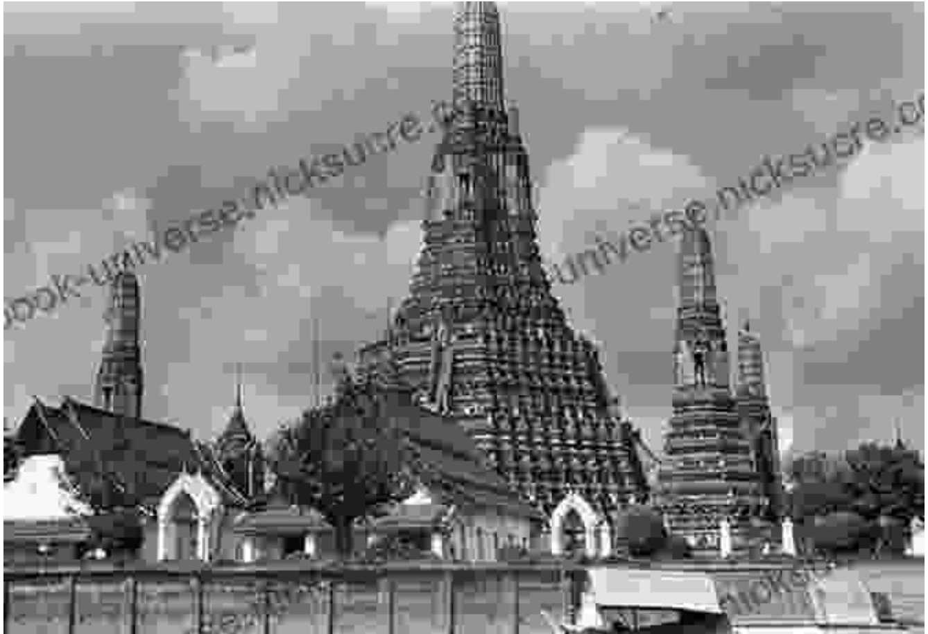
Dianne at a temple in Bangkok in the 1960s