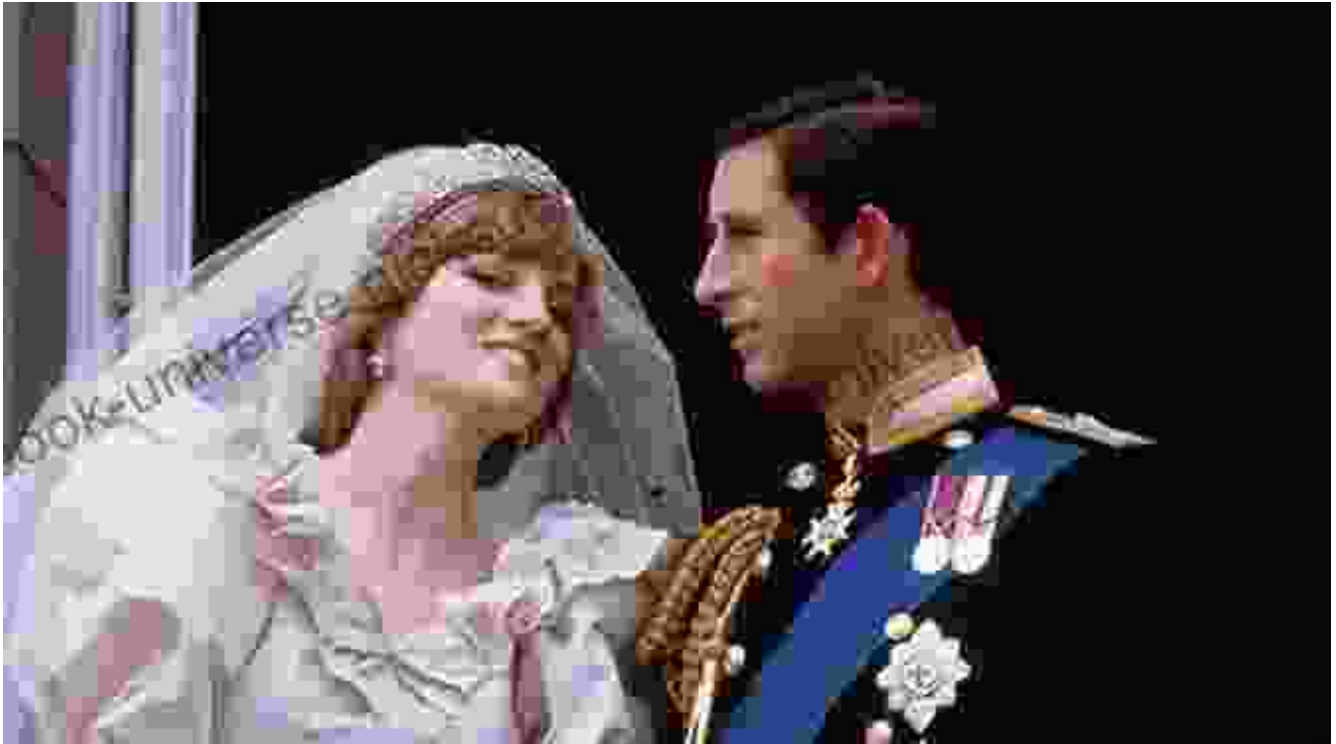
Prince Charles and Princess Diana on their wedding day

In 1981, Prince Charles married Lady Diana Spencer in a lavish ceremony that was watched by millions around the world. Diana was a beloved figure, and her marriage to Charles was seen as a fairy tale come true. However, the marriage was not without its challenges. Charles's continued relationship with Camilla Parker Bowles put a strain on the union, and the couple eventually divorced in 1996.