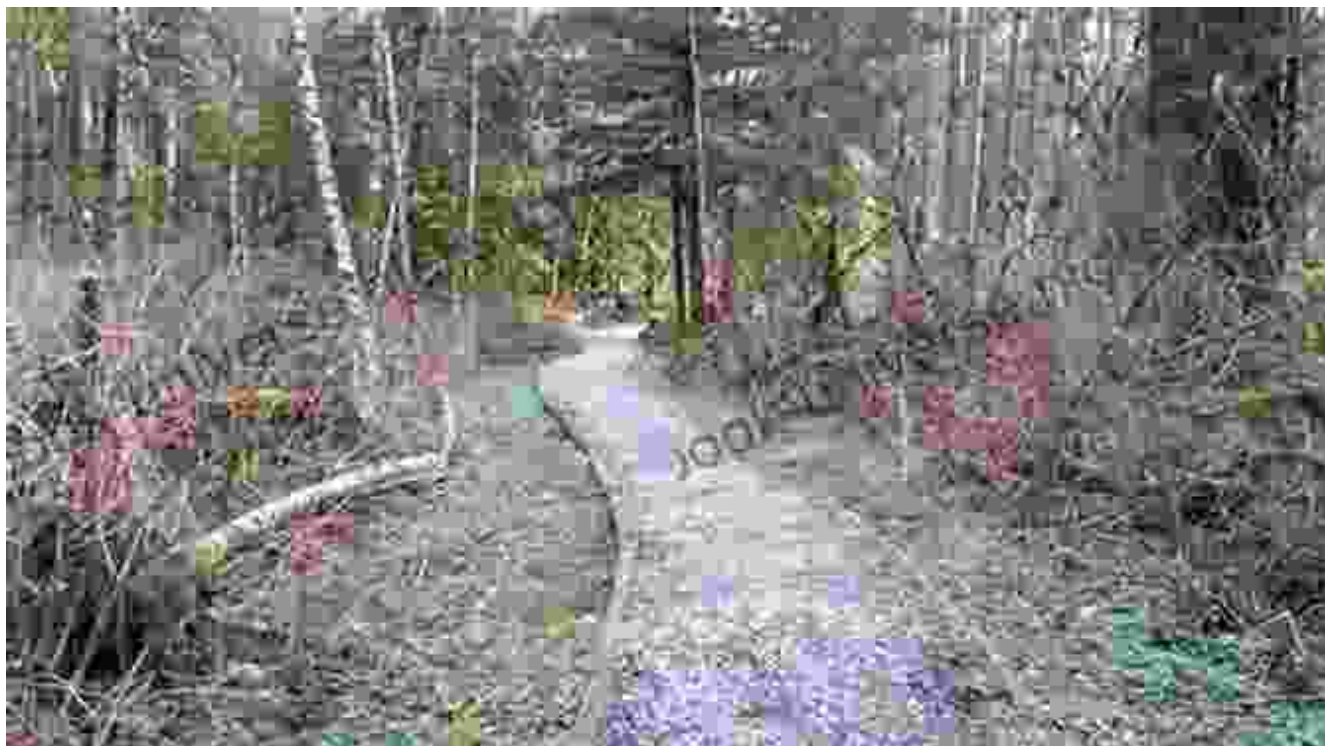
The Old Sauk Trail Today

Despite the encroachment of settlers and the westward expansion of the United States, the Old Sauk Trail remains a testament to the enduring resilience of Native American communities. Segments of the trail have been preserved and incorporated into modern-day roads and landmarks, serving as a tangible reminder of the rich history it holds.