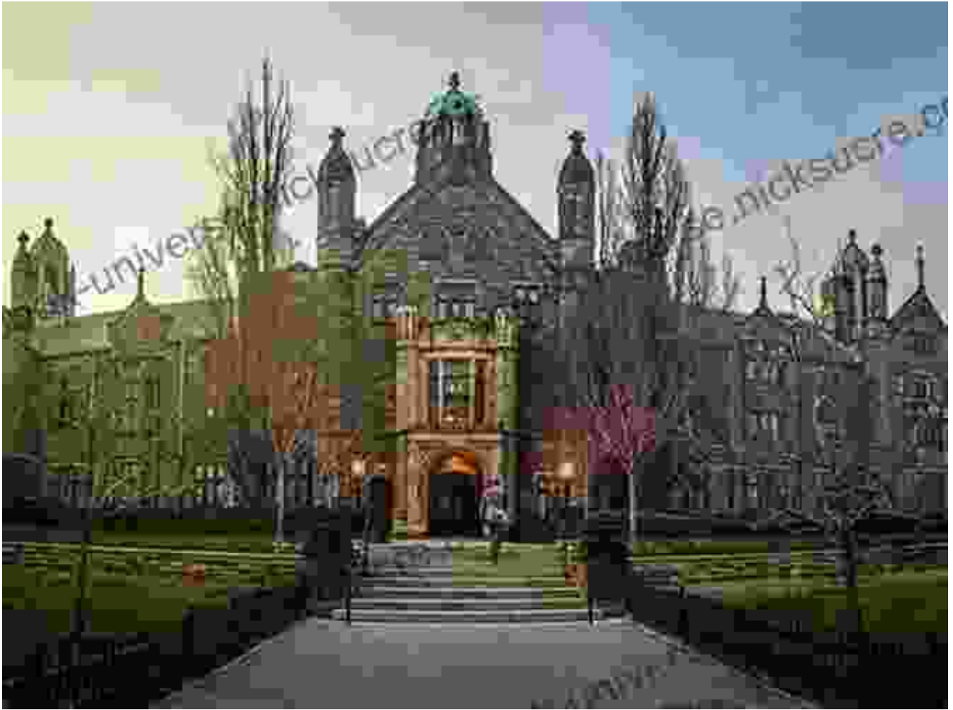
Trinity College, Toronto