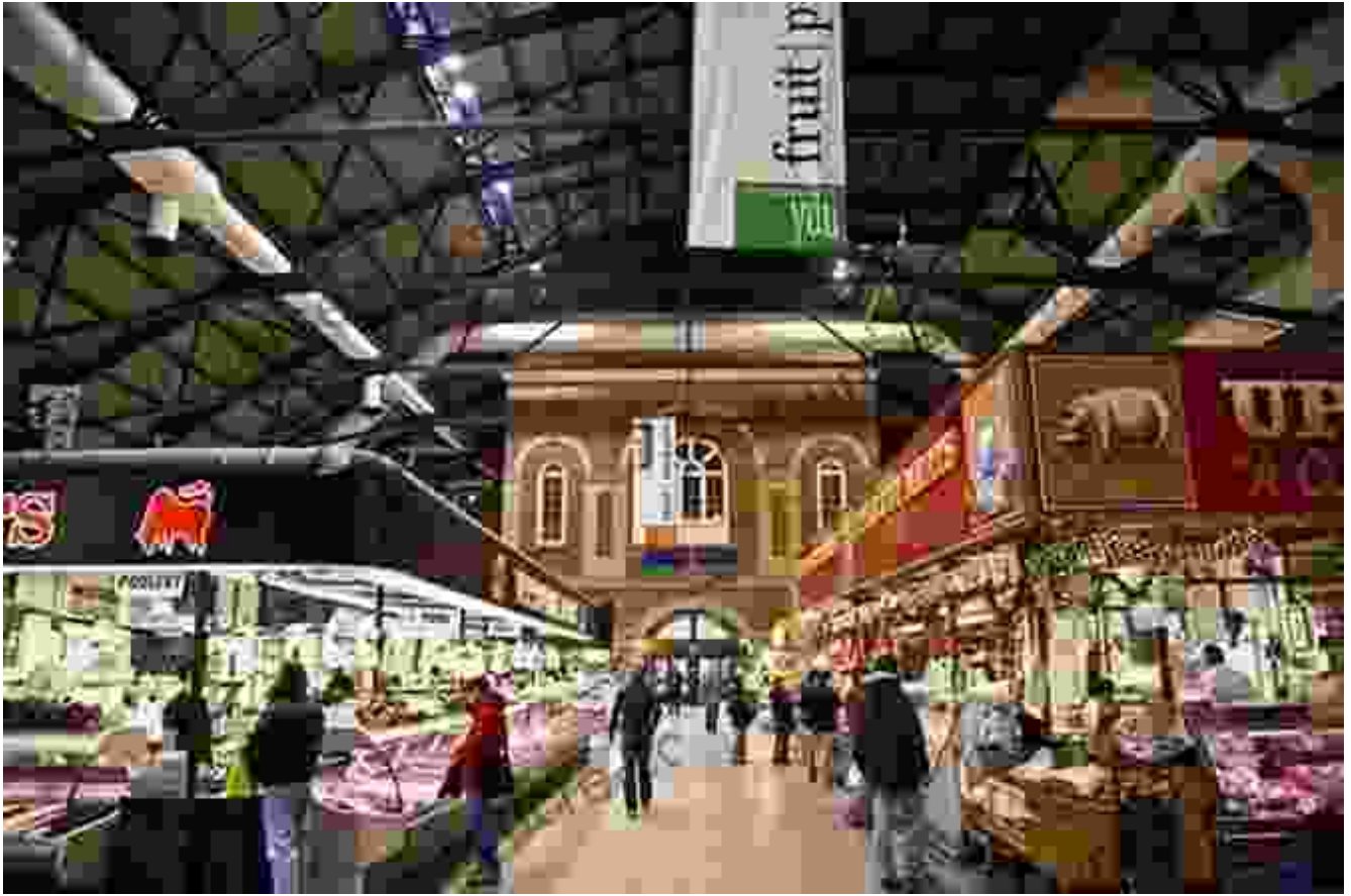
St. Lawrence Market, Toronto