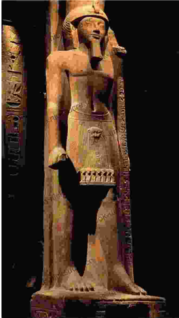
Tausret, the Forgotten Queen and Pharaoh