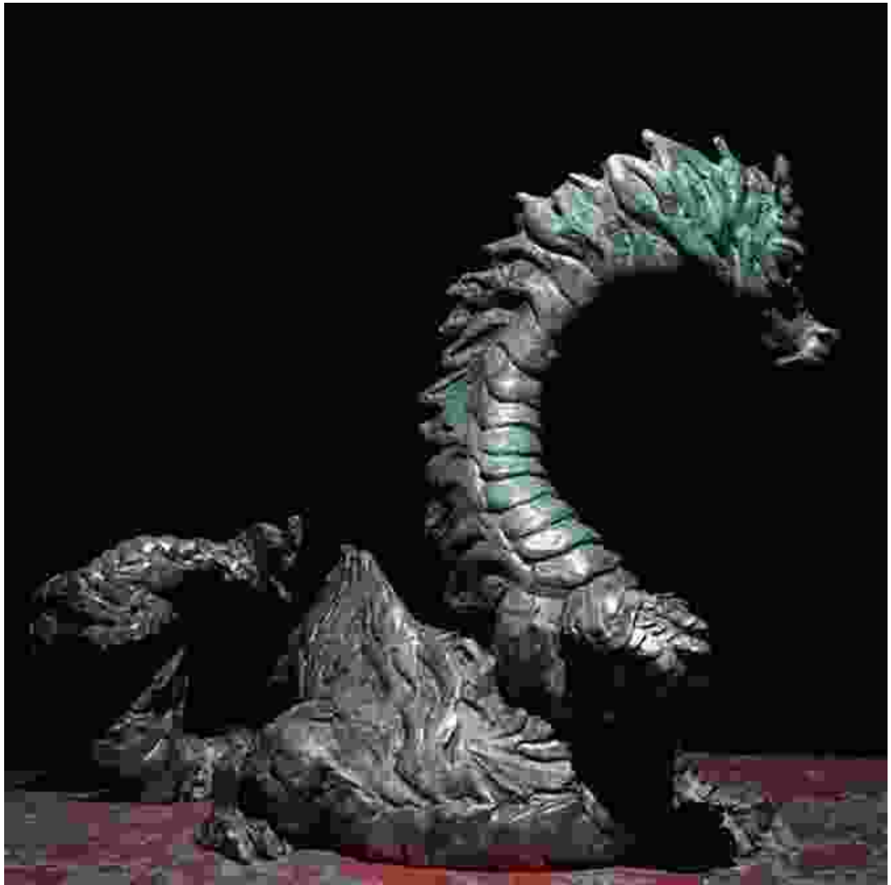
Capturing the Enchantment: The Essence of Silver Sorcery