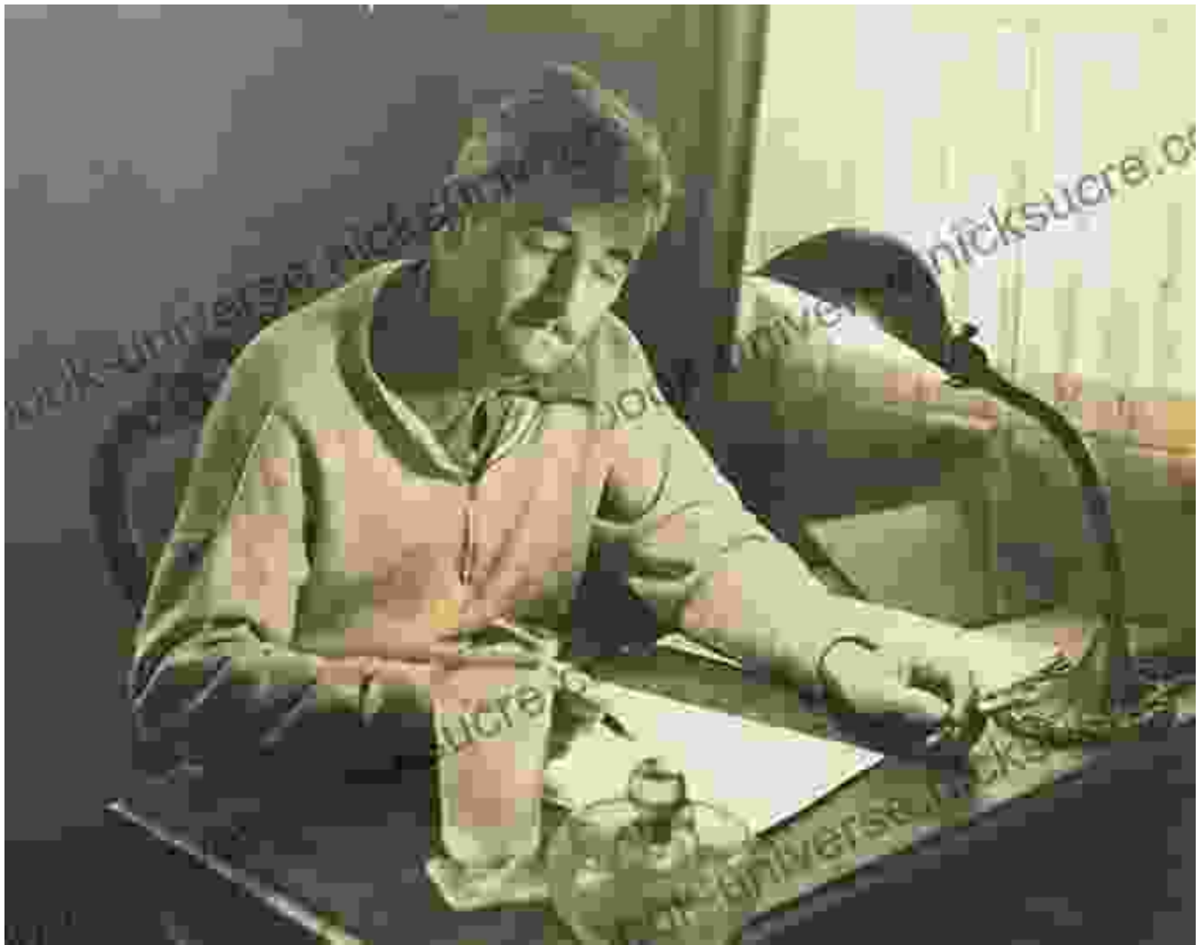
Faulkner at his desk.