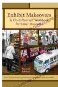
Exhibit Makeovers: A Do-It-Yourself Workbook for Small Museums (American Association for State and Local History) by William Burckart

The DIY Workbook is a practical guide designed to provide small museums with the tools and resources they need to operate effectively. It covers a wide range of topics essential for museum management, including: