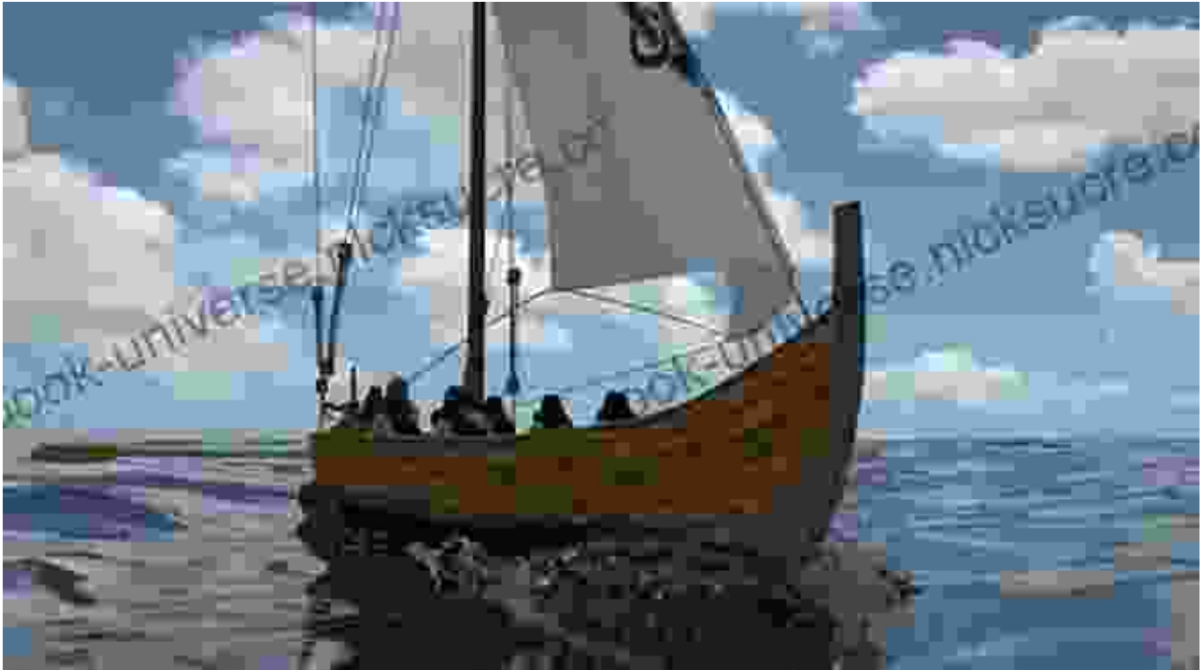
Original drawing of a modern-day replica birlinn

The birlinn, an iconic vessel from a bygone era, played a pivotal role in shaping the history and culture of Scotland and Ireland. Its sleek design, remarkable capabilities, and enduring legacy continue to captivate and inspire people to this day. Through original drawings and detailed descriptions, this article has provided a glimpse into the fascinating journey of the birlinn, a testament to the ingenuity and seafaring prowess of our ancestors.